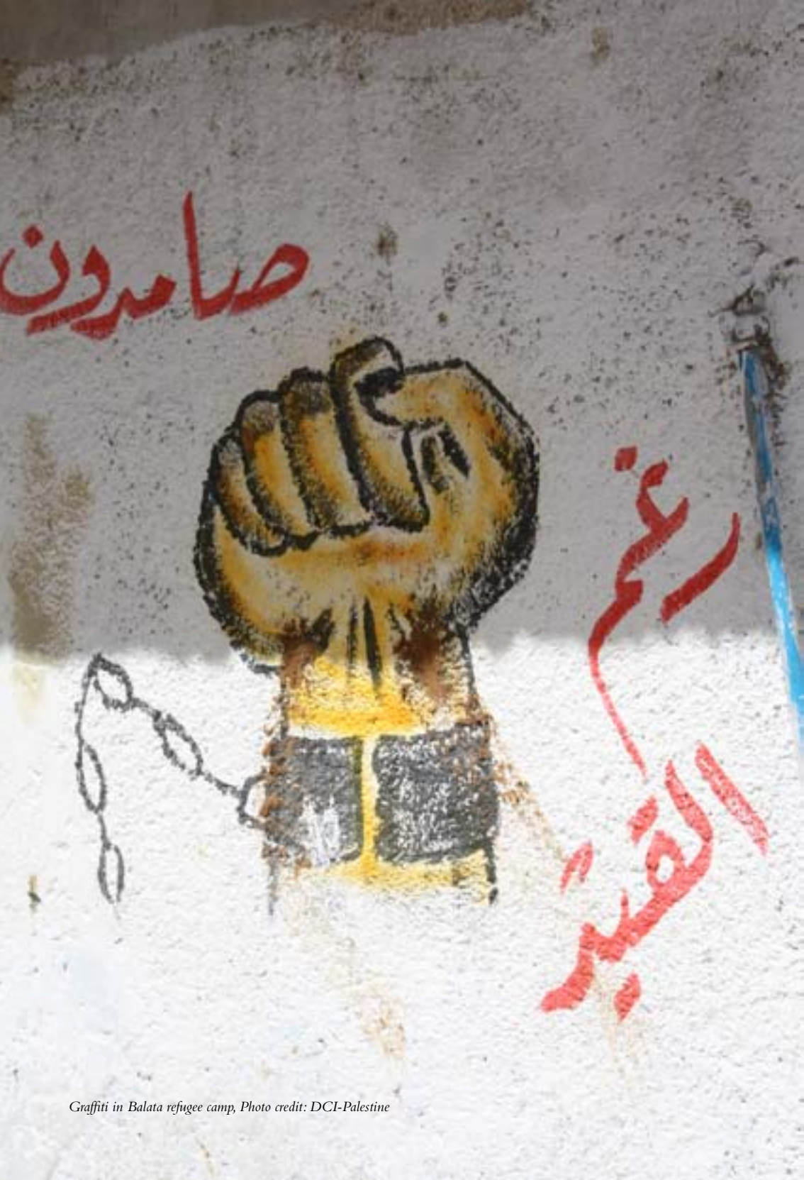
Grffiti in Balata refugee camp