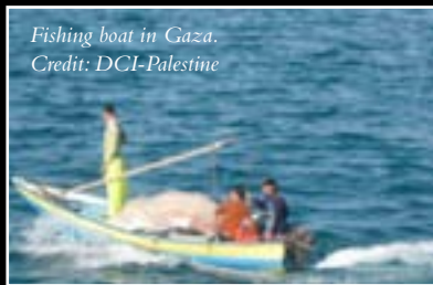
Fishing boat in Gaza.