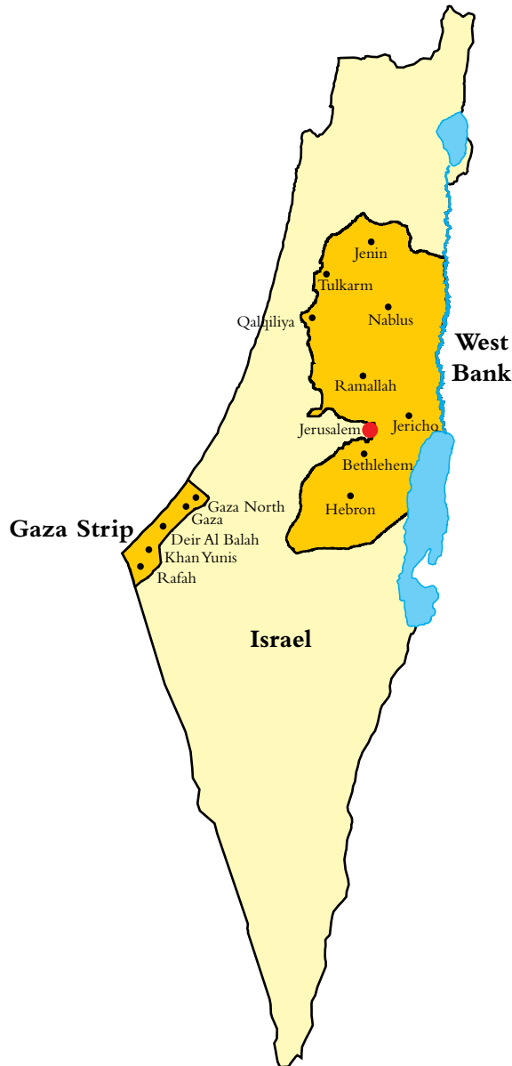
Map 1 – Israel and the Occupied Palestinian Territory