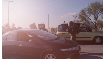
Israeli soldiers hold Palestinian civilians in their cars to prevent children from throwing stones - Silwad

63. In addition, Euro-Mid produced a video 5 in June 2014 documenting an Israeli soldier storming a home in Silwad, then using it as a watchtower for snipers. The home's residents – two elderly Palestinians with American citizenship – were herded into and kept in one of the rooms after their phones were confiscated.