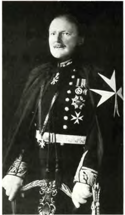
Jerusalem governor Ronald Storrs, posing for posterity ( Orientalists , Storrs, 1939)