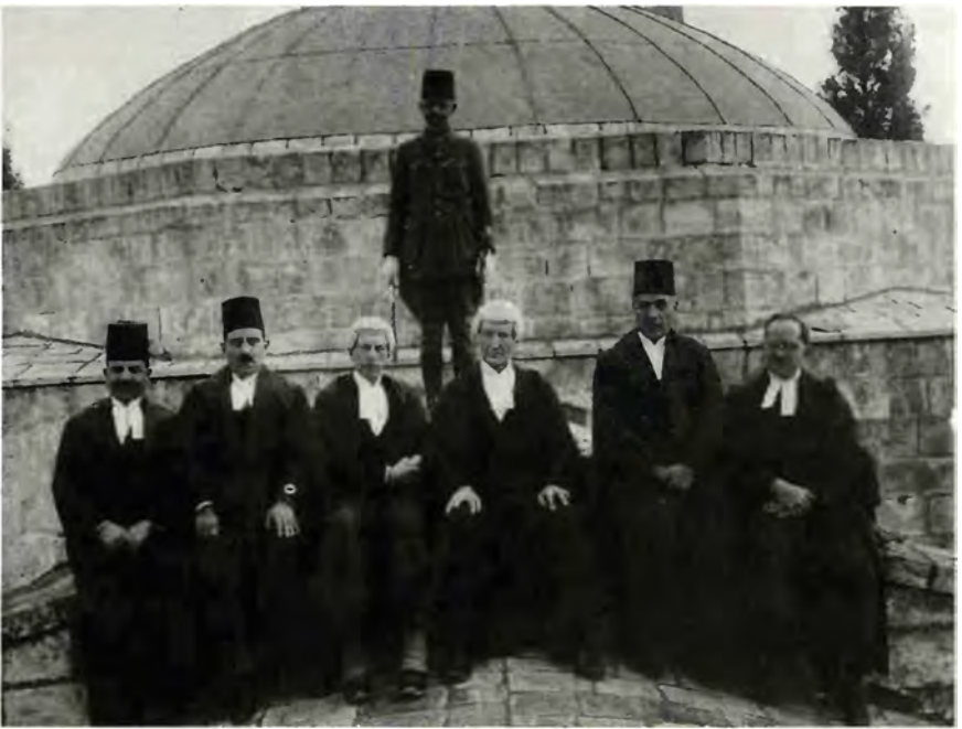
“One sunny morning seven men went out onto the roof of the courthouse in Jerusalem to have their picture taken . . .” The judges, 1925.