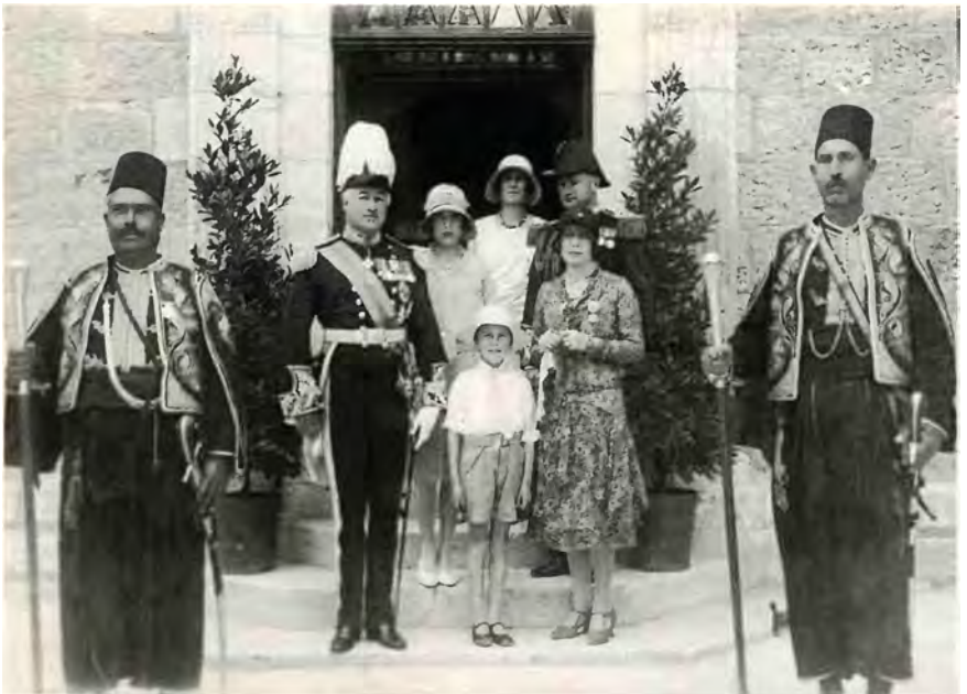
"A loathsome country . . ." High Commissioner John Chancellor, 1928.