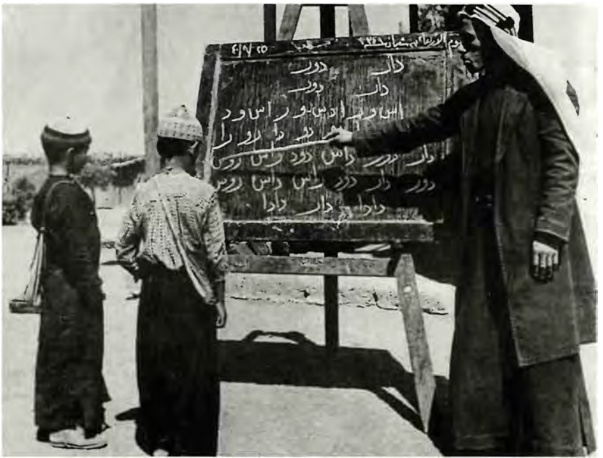
A lost generation: only three out of every ten Arab children learned to read and write.