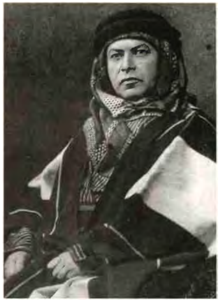
... and as a man of the Middle East (The National Library)