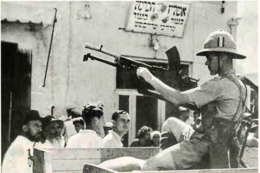
British patrol: “Palestine is a millstone around our necks”—the colonial secretary