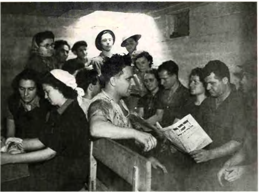
Tel Aviv, 1941: in shelters as Italian aircraft bombed the city