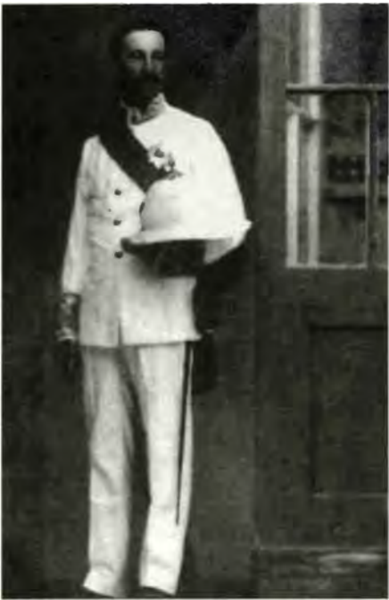
Herbert Samuel, Jerusalem, 1923