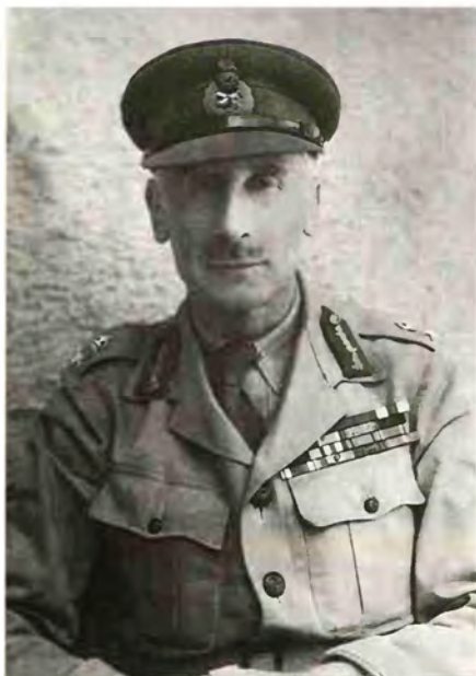
General Evelyn Barker