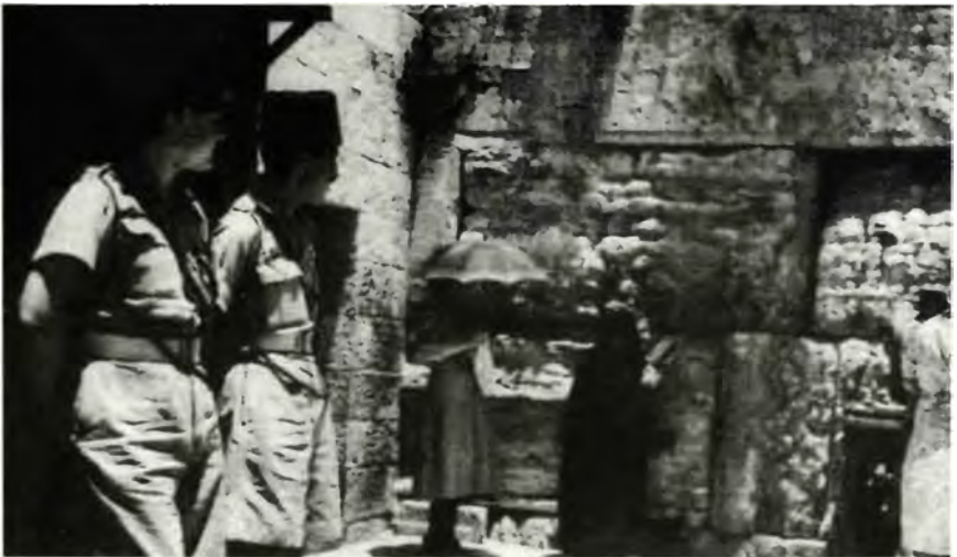
The Western Wall, 1928