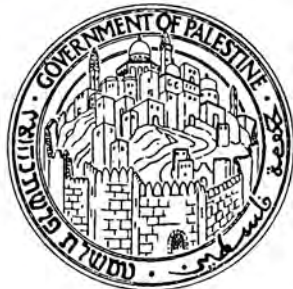
"The government agreed to add Hebrew to all its proclamations: English would be printed in the center, Arabic on the right, and Hebrew on the left ..."