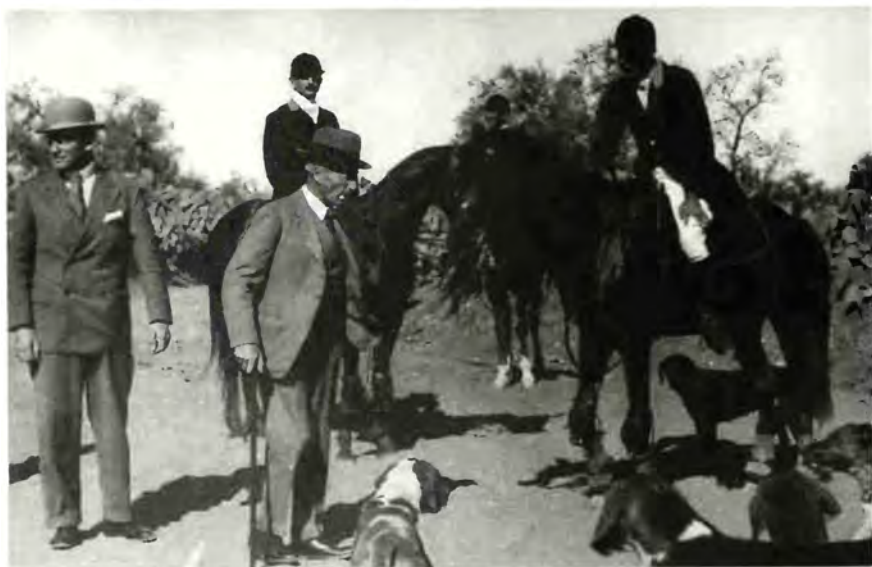
Wauchope and his men at the hunt