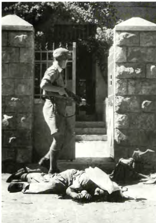
Jerusalem, June 1947. “The English have betrayed us..” —Nathan Alterman