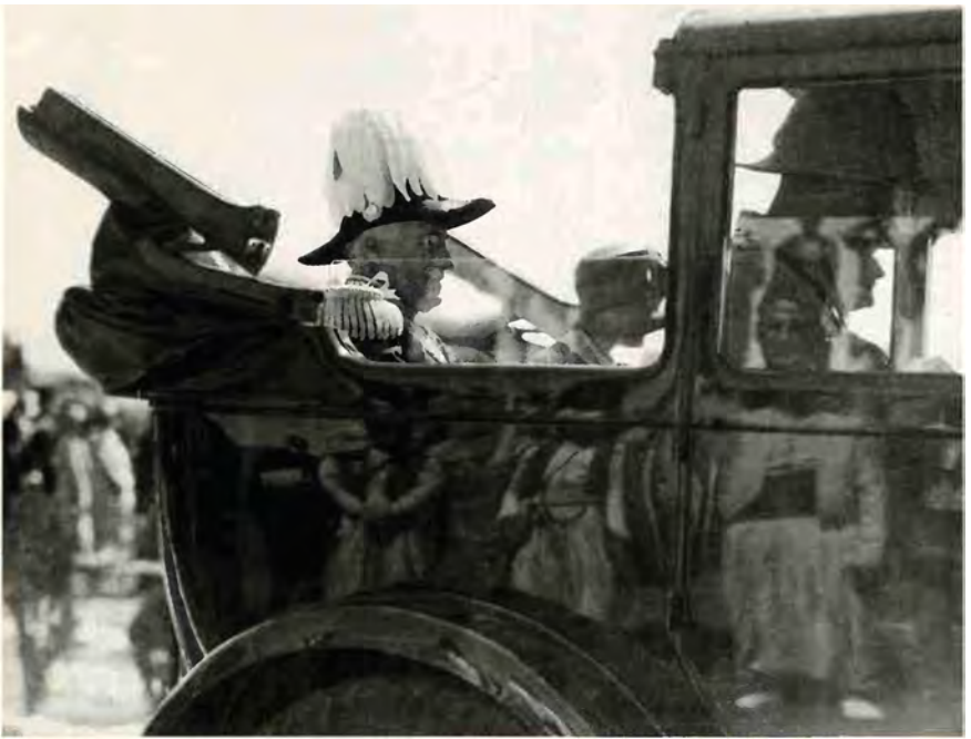
High Commissioner Herbert Charles Onslow Plumer, Jerusalem, 1925