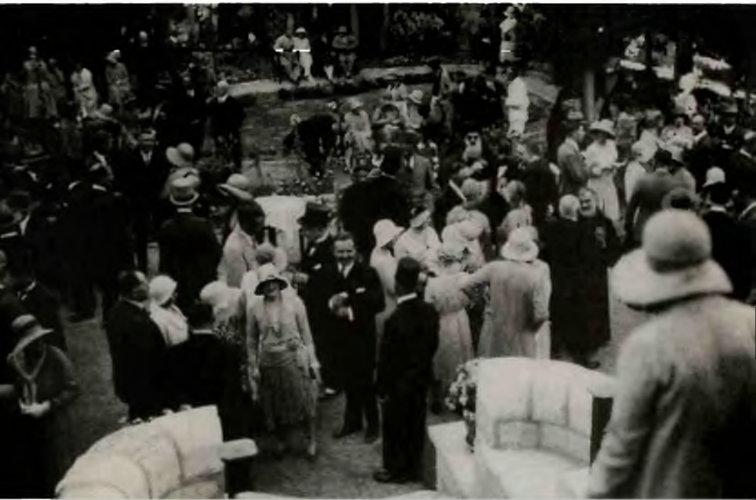
A garden party at Government House: "... surrounded by a pine grove and gardens, the stone mansion . . . exuded majesty and permanence, and one glance left no room for doubt: the British Empire had come to stay." (Zvi Oron)