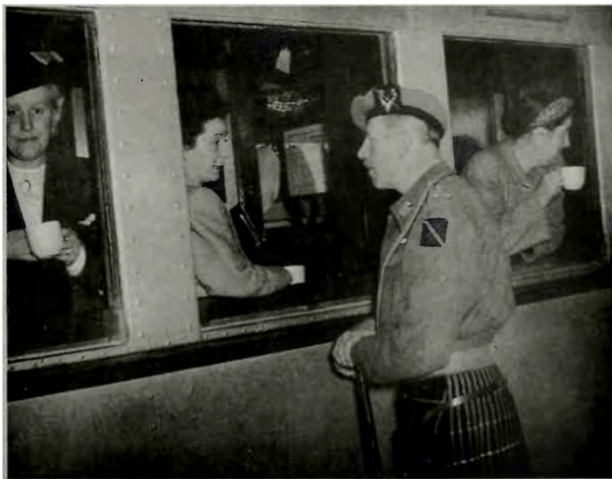
Lod, 1948: “It’s time to be going.”