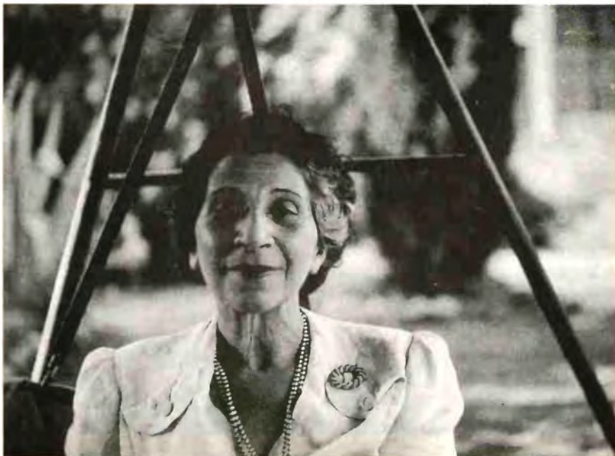
Katy Antonius